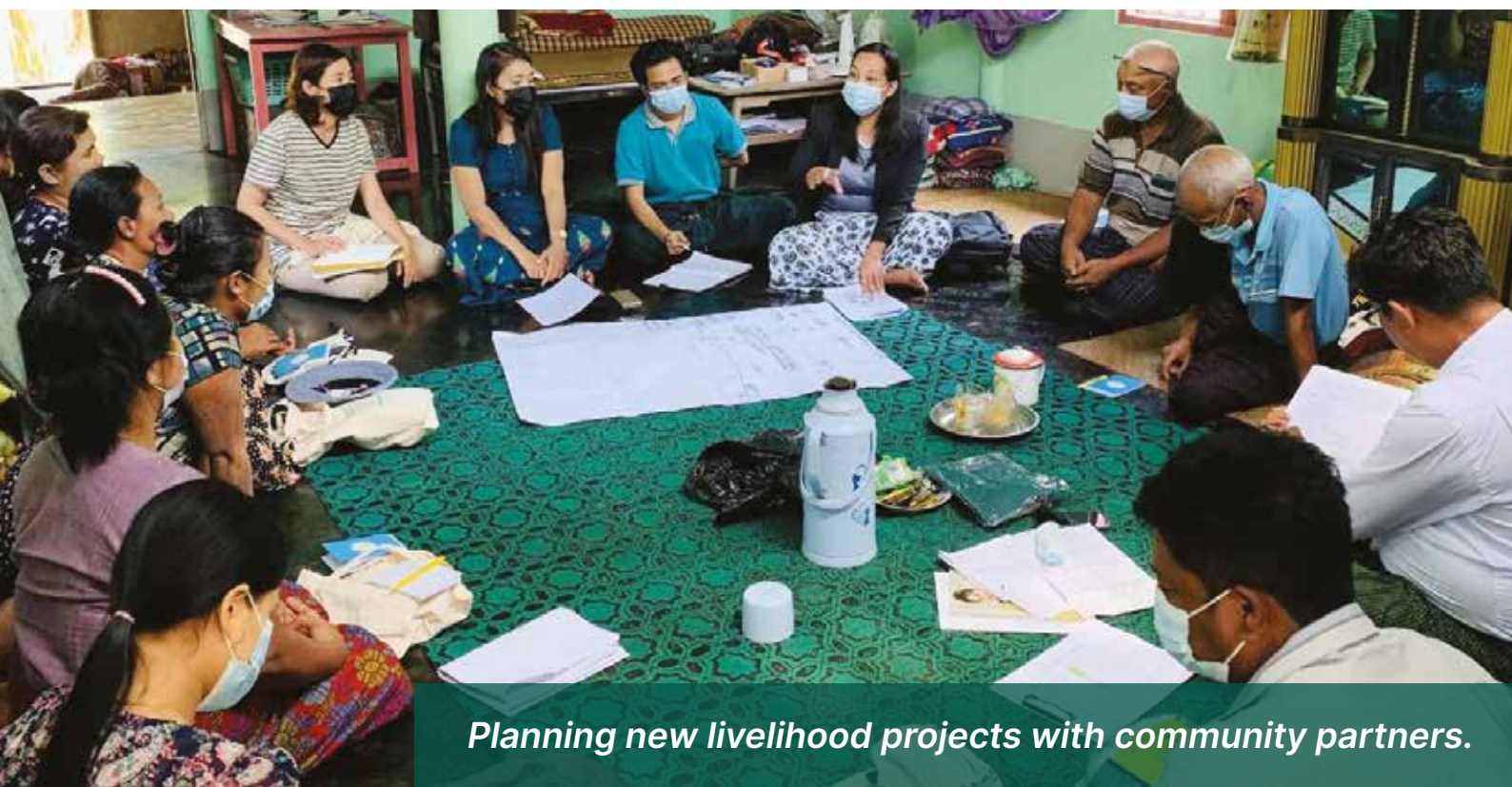
Planning new livelihood projects with community partners.

Our aim is to move ahead with needed methodologies for seagrass conservation and seaweeds projects with relevant partners on a priority basis. These blue carbon projects represent large potentials for increased climate action.