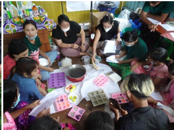
Soap making training at Chaung Tha areas