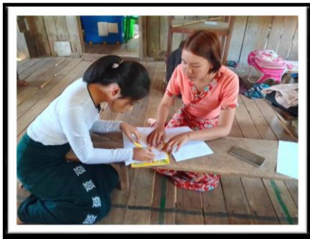
Support scholarship stipend pay to recipient student

Scholarship Program: To ensure that all targeted women have access and complete their continued education, including university, WIF has continually supported the financial needs of students to complete their education that contributes to national growth and prosperity. Forty-one students from Grade-9 to university level are selected to support scholarship grants in the upcoming academic year.