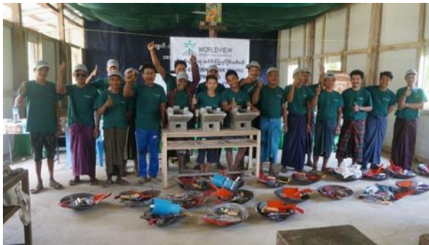
Fuel efficient stove making training

WIF has organized fuel-efficient stove making training for 37 persons and provided both practical and theory lessons on building a fuel-efficient stove to use and saving less pressure on firewood. The training on basic handmade personal care product making training was conducted to seven villages in Chaung Thar for women and youth to learn for their own handmade technique and start own businesses positive. Moreover, WIF has supported home garden training to 40 participants in 4 villages as a strategy to enhance household food security and nutrition. Home gardens are an integral part of local food systems and addressing food insecurity and malnutrition as well as providing additional benefits such as income and livelihood opportunities for resource-poor families and delivering a number of ecosystem services. In addition, WIF has trained youth pioneers from Chaung Tha and Bawmi areas to build video shooting/editing capacity with mobile phones to produce stories that matter to them and/or their communities.