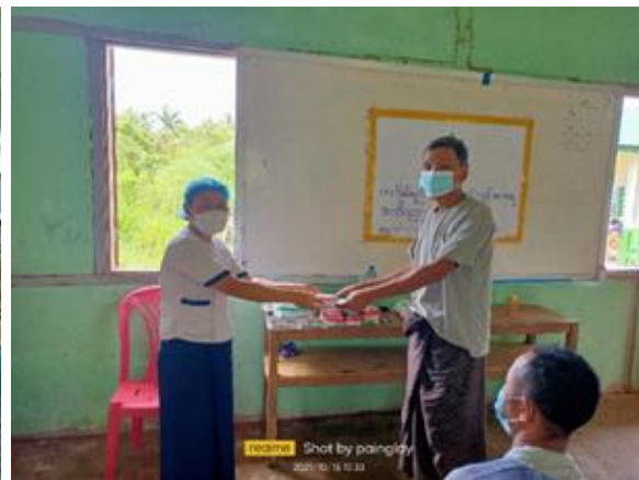
Hygiene and health awareness session in project area