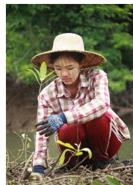
Women participation in Planting activity

WIF has actively engaged in mangrove restoration in Myanmar since 2012. Its sustainable livelihood projects are designed to implement the project activities through a community participatory planning approach proposed by the Village/Community Development Committees (V/CDC) and endorsed by WIF standard guidelines and selection process to prioritize projects with the highest impact. WIF's Livelihood Unit also provides technical assistance and guidance to the Village/Community Development Committees in charge of project implementation to ensure grassroots participation of the village.