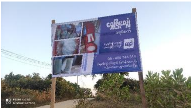
Fig: Ice plant bill board at the coner of the road