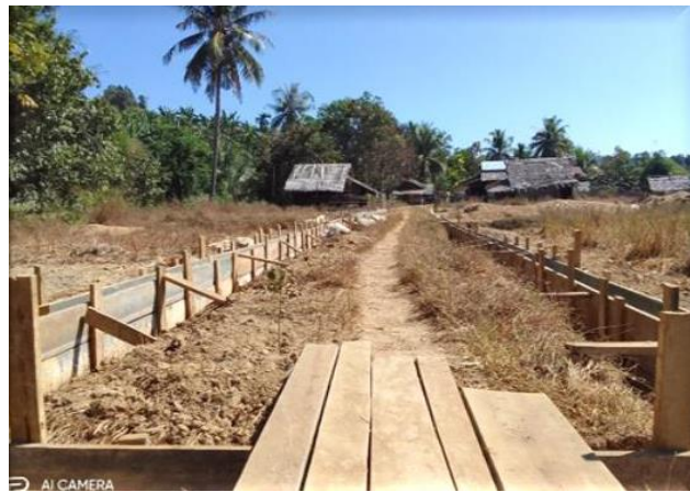
Road construction project in Ka Nyin Kwin village and Pyar Tike village

Improving safe water accessibility and sanitation: To easy access to clean drinking water, WIF is supporting hang dug well project through the leading of village development committee for the people living in low-lying areas are particularly vulnerable to disruptions in their access to safe water. In addition, WIF has supported fly proof toilet for sub rural health center in Kan Gyi village to improve good sanitation for a healthy living environment for people and to protect the natural resources such as surface water, groundwater, and soil, and provide safety, security and dignity for people when they defecate or urinate.