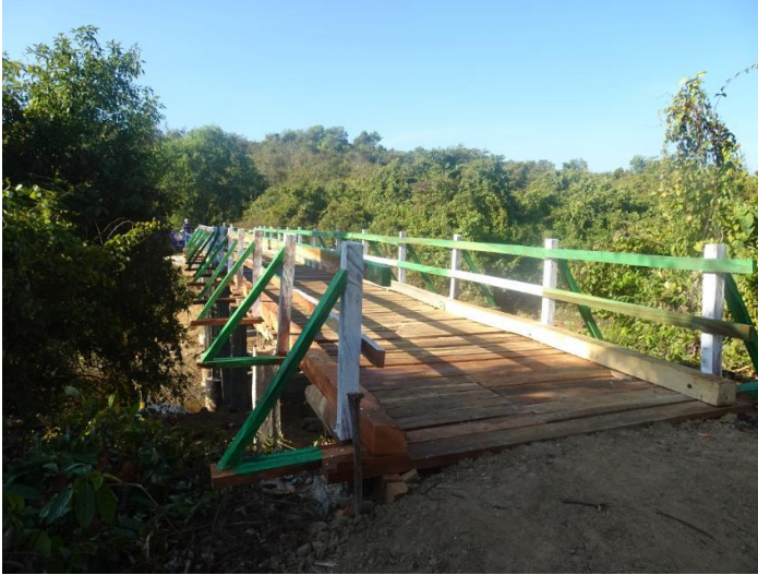
Wooden bridge construction at Chaung Tha Ward (2) and Nga Pain Ta Lae village