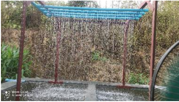
Fig: Producing of Ice block

availability of ice. The project has a very high social and economic impact on the sea harvesting economy and food security in the area.