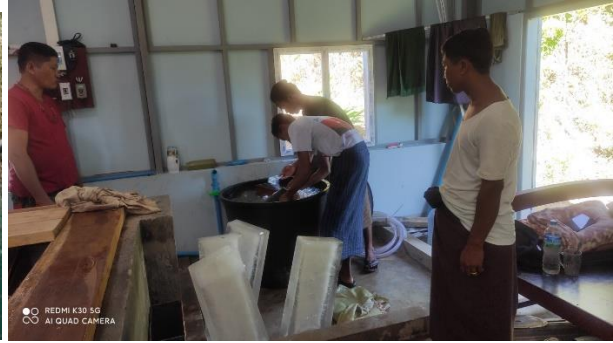
Fig: Producing of Ice block