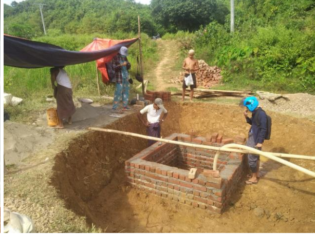
Fly proof toilet in Ka Nyin Kwin village and Well digging project in Magyizin Pyar village

Rain Water Harvesting project: The main purpose is to help alleviate the shortage of drinking water during the summer and to reduce the spread of contagious diseases through contaminated water, and to increase the number of healthy families by providing big clay pots to the 33 disadvantaged households in U To village, Kan Gyi area.