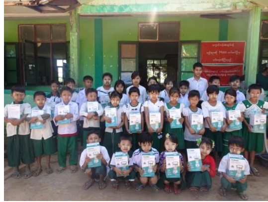
Solar lamp provided to school children