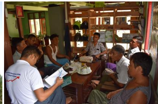
Fig: Management Committee Meeting