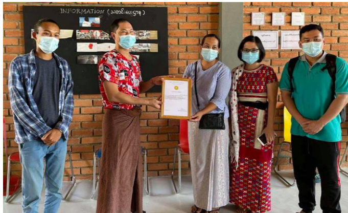
Provision of clinical materials to local general hospital

During the pandemic period, WIF has supported the basic food items such as Rice, Cooking Oil, Onion, Eggs, and beans to solve food shortages during the lockdown period, as well as the lack of income due to not being able to work. In addition, WIF has provided personal protective equipment (PPE) such as surgical masks, hand sanitizer, Infra-Thermometer, hand gel, etc., to the Covid-19 Task Force Committees and clinical materials such as patient monitor and electrocardiogram to General Hospital.