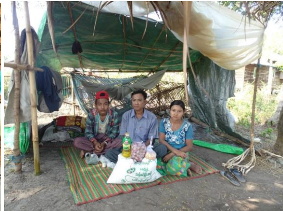
Food items distribution to beneficiary