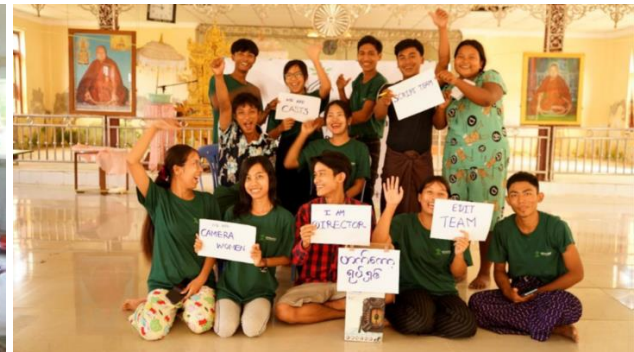
Video shooting/editing with mobile phones training