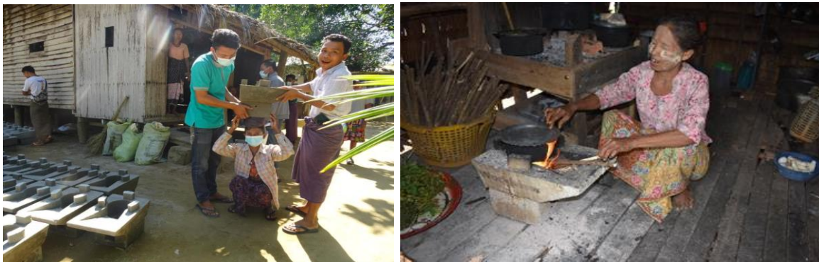
Beneficiaries received fuel-efficient stoves and using for cooking