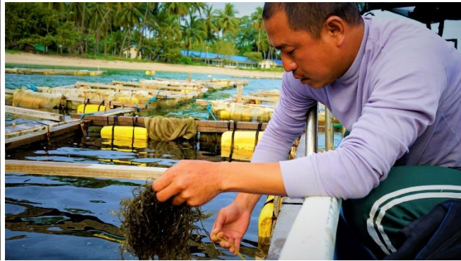
Skin care product production from the seaweed extracts