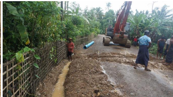
Improving drainage system in project area

Improving better transportation to access economic and social services: WIF has supported village access wooden bridge in Chaung Tha to improve better transportation to access economic and social services through renovation of wooden bridge is 90 ft at Ward (2) and 92ft length of timber bridge in Nga Pain Ta Lae village. In addition, road renovation is implemented 700 ft long in Ka Nyin Kwin village and 600ft long in Pyar tike village to improve better access to social services, market, etc. according to the community proposals through the village development committee.