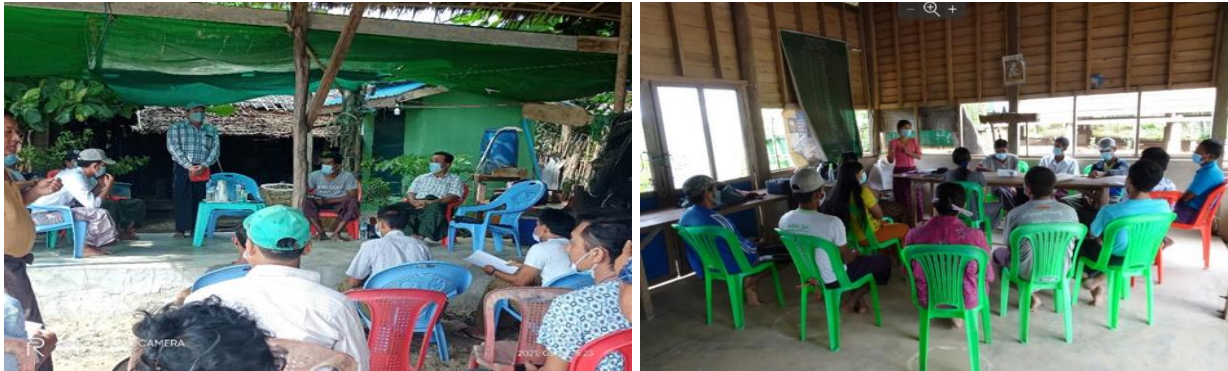
Meeting with Village Leaders and community members at Bawmi and Chaung Tha areas

have a seat at the table and can participate in the process on an equal footing, ownership, and builds a strong base for the intervention.