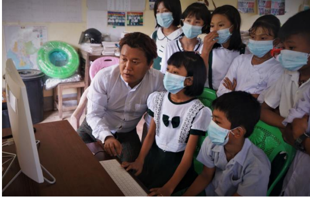
Students learning IT knowledge in school