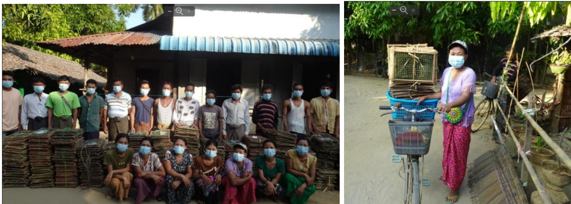
Crab equipment distribution to the beneficiaries in Chaung Tha areas