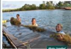
Worldview International Foundation delivered a seaweed production training in Shwe Thungyan project area, Ayeyarwaddy region. After delivering the training, the trainees were implemented seaweed farm project as a group with the support of WIF. In July, individual business farming expanded successfully with the support of revolving fund.