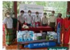
The Worldview International Foundation provided oxygen and other medical supplies to a relief group in Kuan-Chan-Kuan township, Yangon Region on 9th September, 2021.