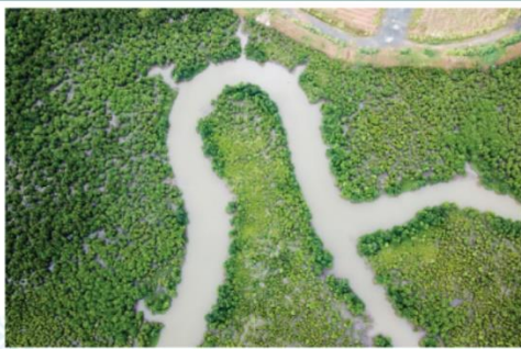
A drone shot of mangrove forest in Shwe Thung Yan area, Ayeyarwaddy Division