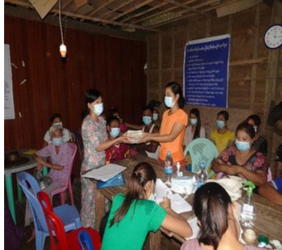
Bookkeeping training and disbursement village revolving fund in the Chaung Tha area