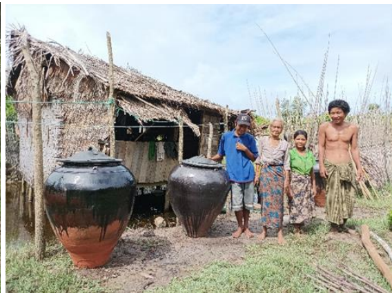
Provision of big clay pots to the disadvantaged households at Chaung Tha area