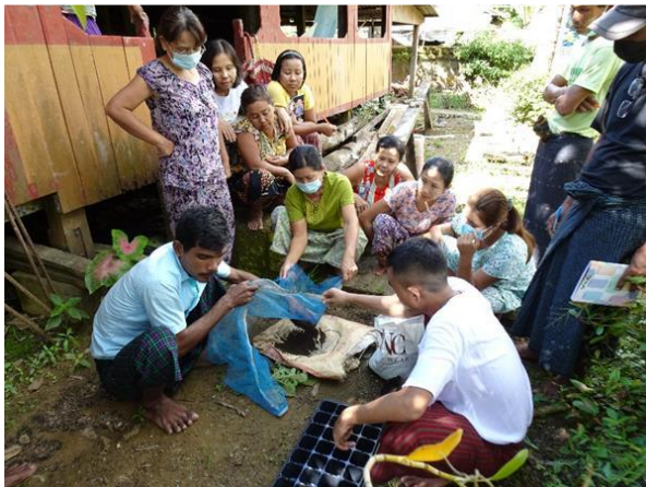
Home Garden training