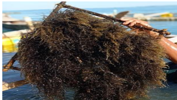
Seaweed production in the chaung tha areas

Seaweeds have been used as food, skincare and personal care, etc. in some civilizations around the world and it has been reported that edible seaweeds are rich in proteins, lipids and dietary fibre. Seaweed project has started in August 2020 in Shwe Thaug Yan area, Ayeyarwady Region, Myanmar. WIF has selected to cultivate Gracilaria spp in the farm and it is a group of warm water seaweeds. This project is to develop and produce seaweed value-added product such as food, snacks, skin care, cosmetic, soap, etc. especially for the local people by supporting both technical assistance and services as it is a good livelihood opportunity for the local communities to get extra income and trade by growing this seaweed. Worldview International Foundation (WIF) is producing skin care; sjolive products in support of the business partner to identify viable commercial opportunities and establishing business development plan to achieve sustainable livelihoods and community development for our targeted communities for their sustainable income.